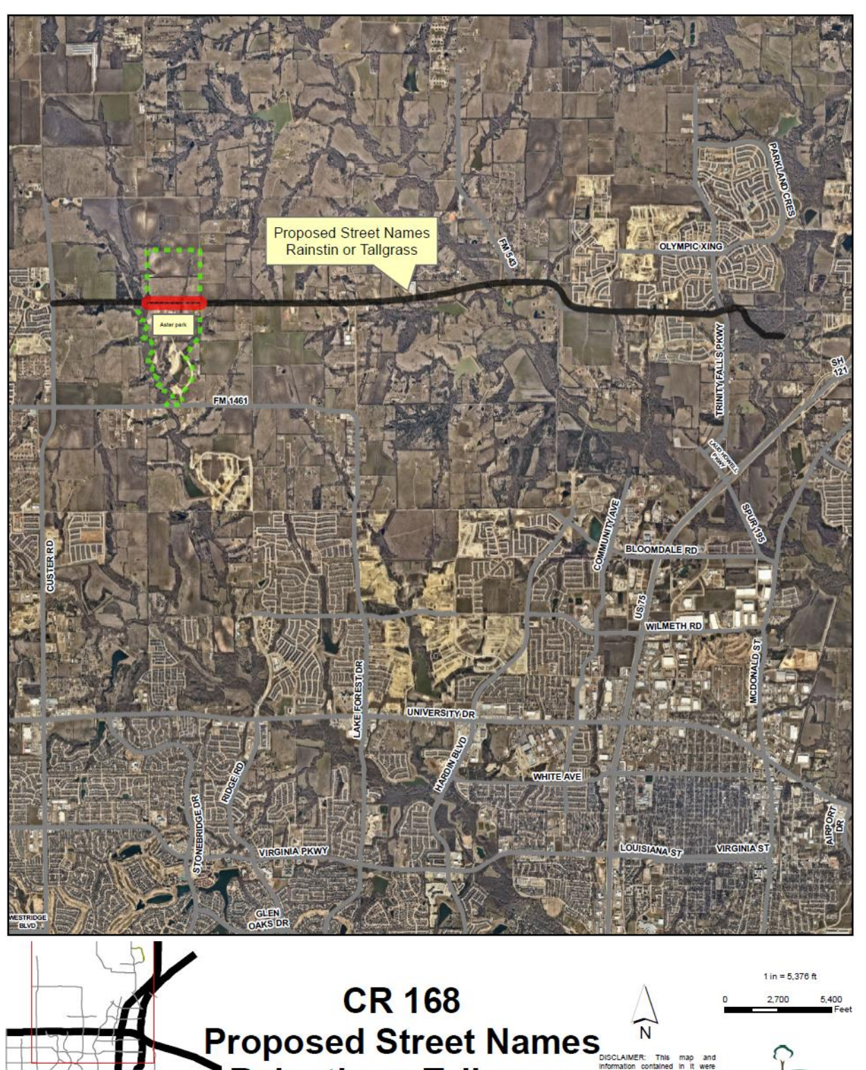
Appendix B: Arterial 5 Roadway Location Map