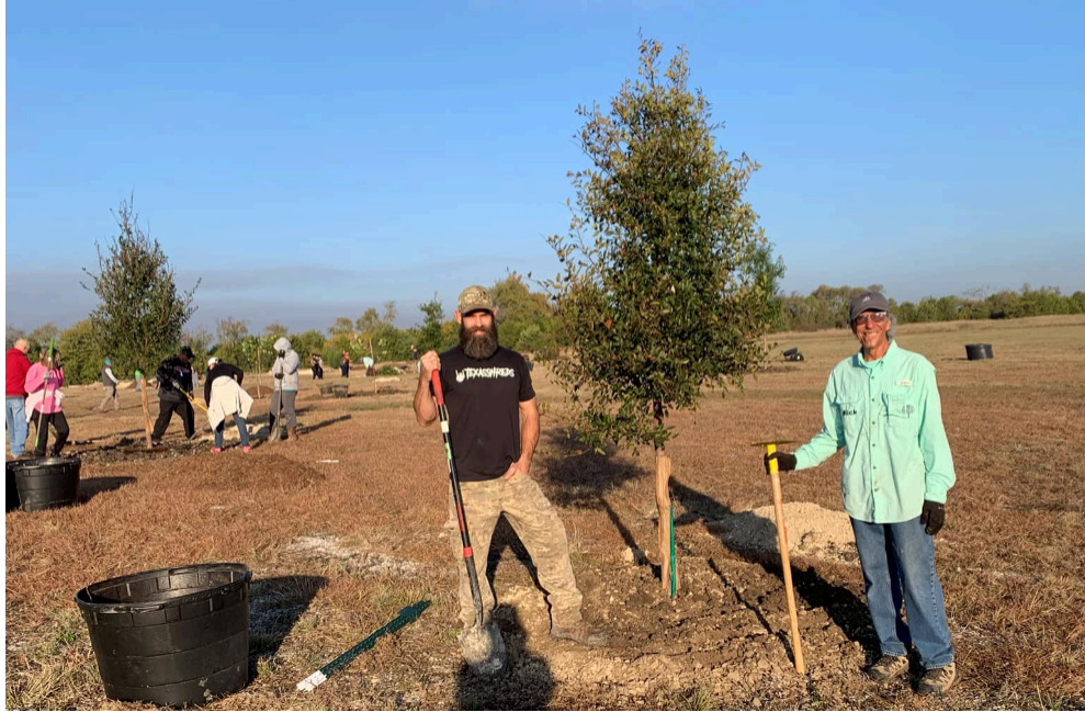
Planting Trees in an impacted Erwin Park open space alongside with the City of McKinney Parks Department, DORBA and members of the community