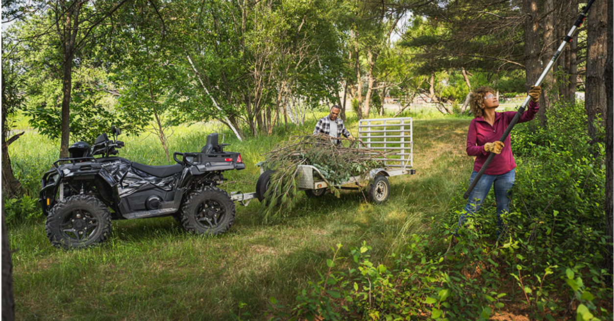
1.25" Hitch receiver that allows to quickly connect a trailer and pull heavier loads up to 1,350-lbs