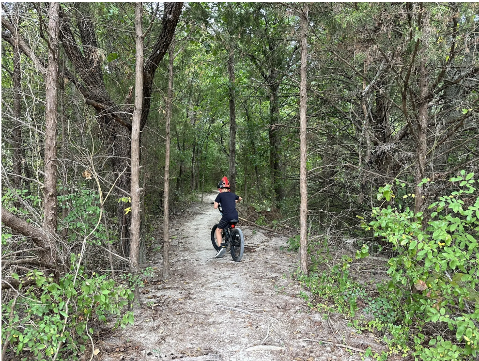
A repaired narrow section of trail being utilized by McKinney youth for recreational sports