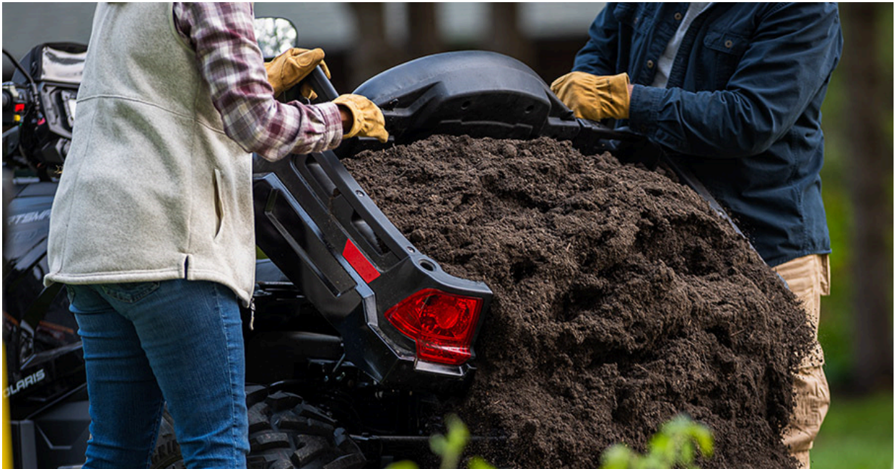
Industry-exclusive 400-lb dump box offers quick latching for easy release, making quick work of big tasks