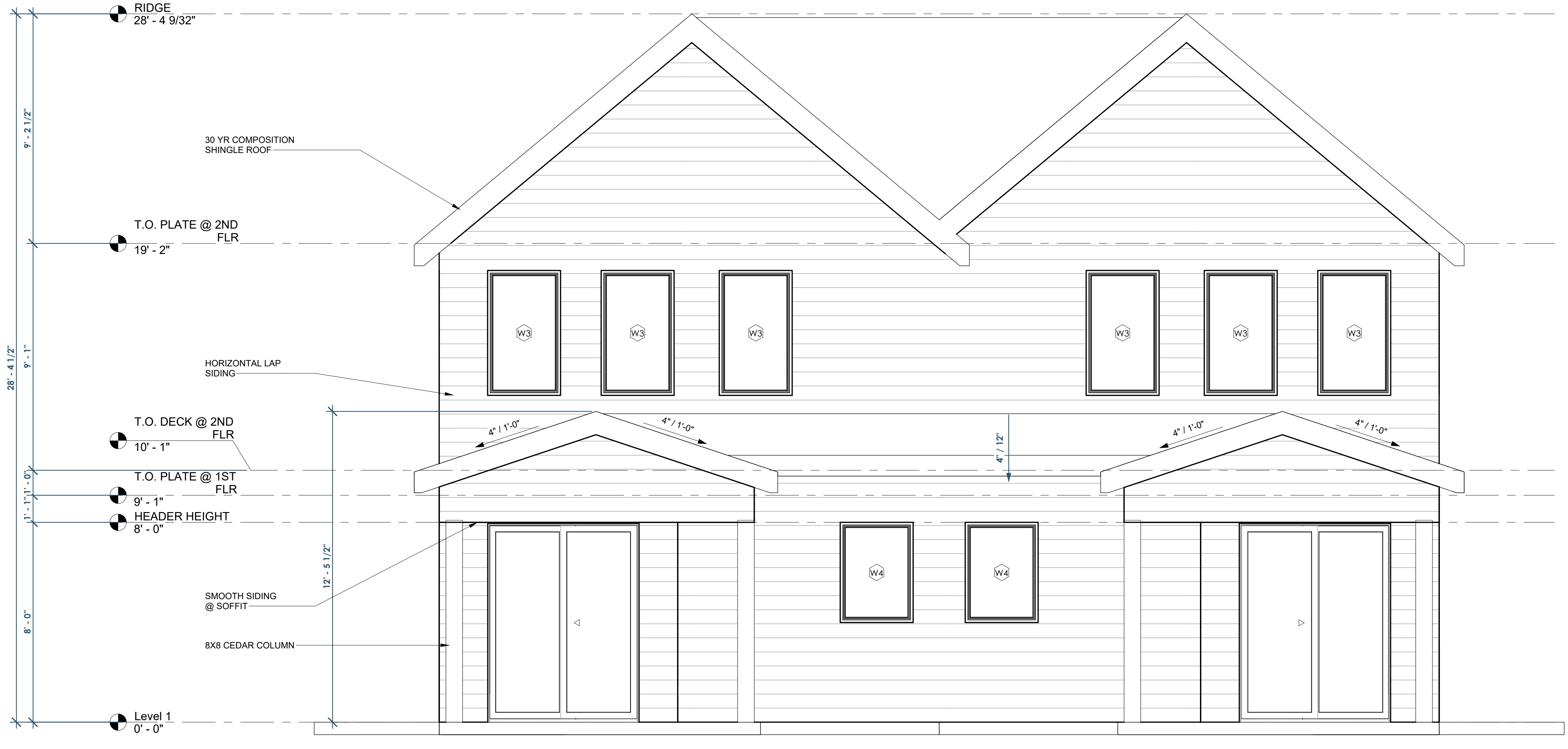
2 BACK ELEVATION 3/8" = 1'-0"