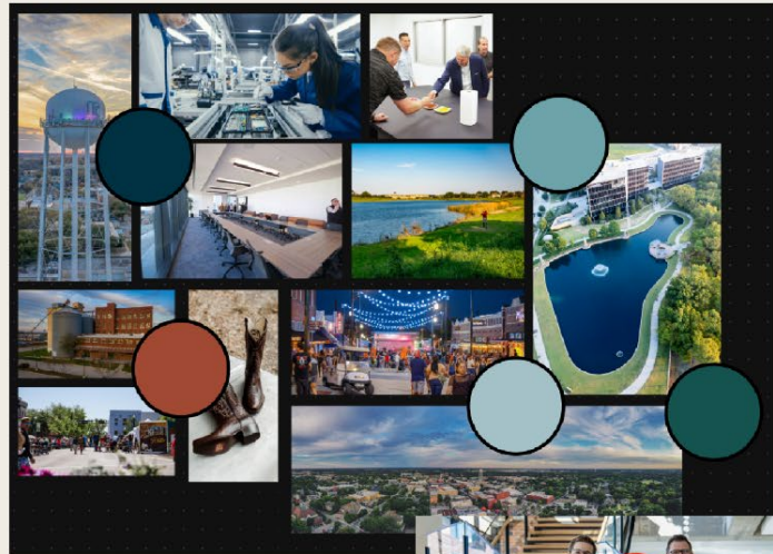
CITY COMMUNICATIONS TEAM