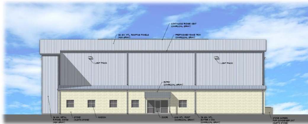
2 RIGHT SIDE ELEVATION 1/8" = 1'-0"