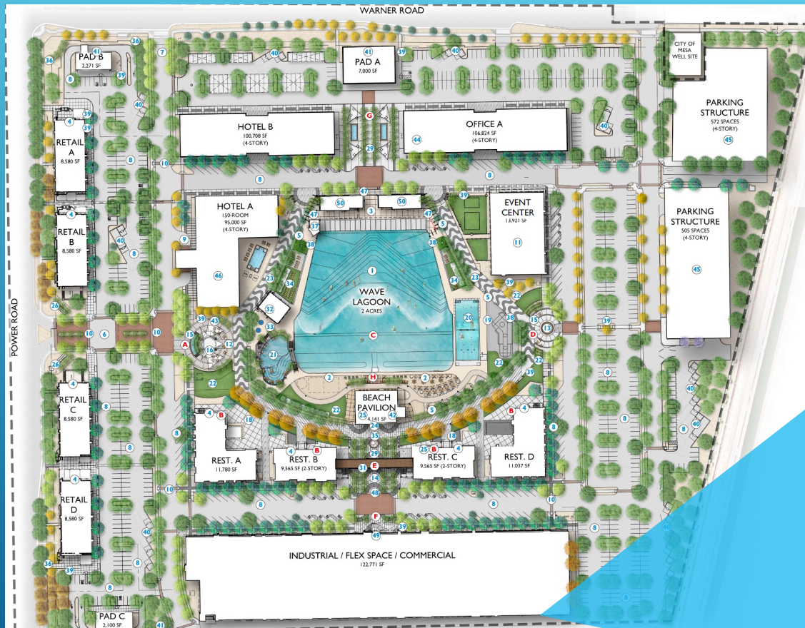
illustrative master plan