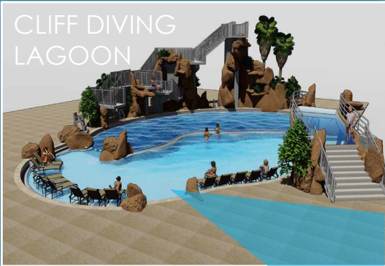
CLIFF DIVING LAGOON