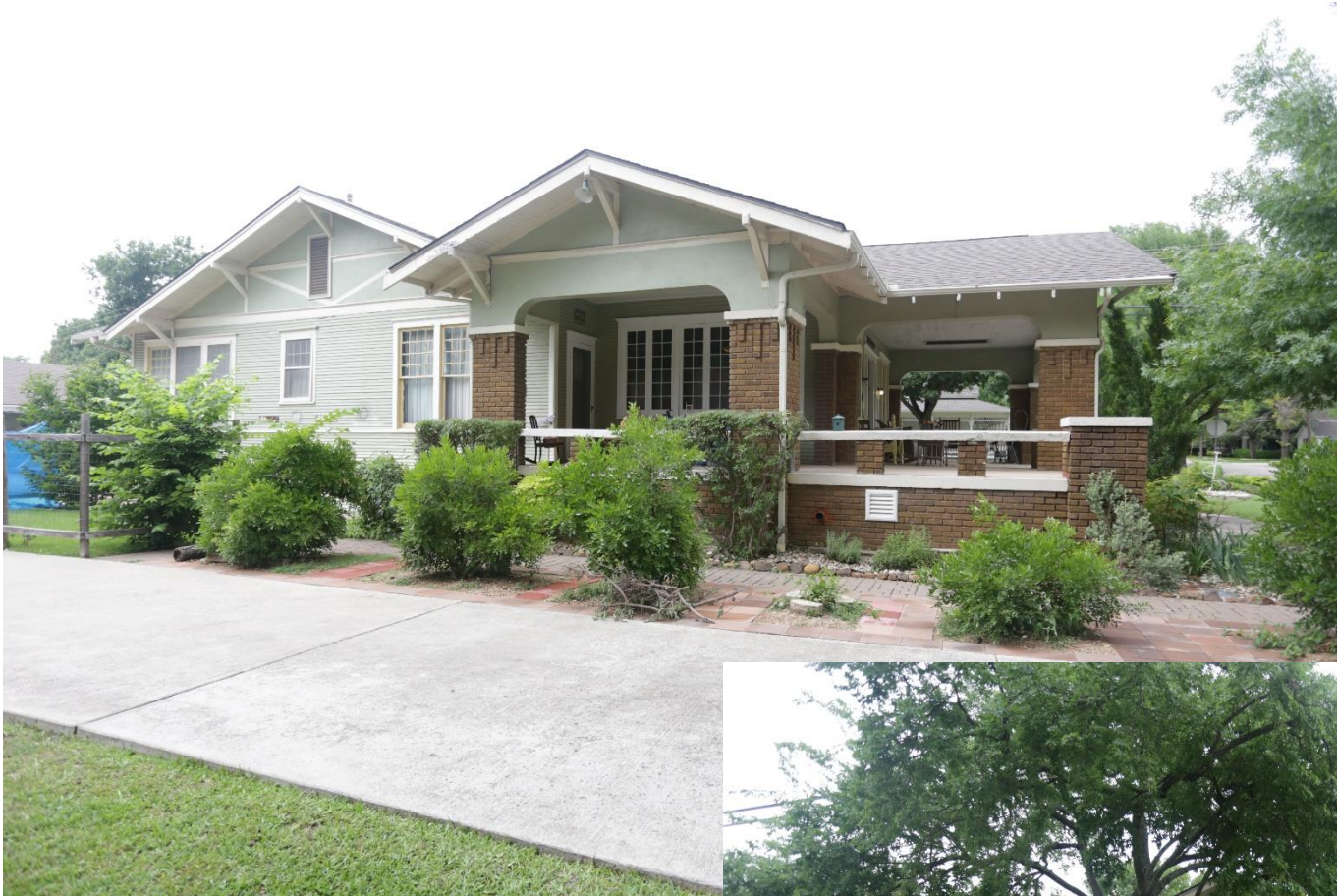
Left: East elevation Bottom: North elevation