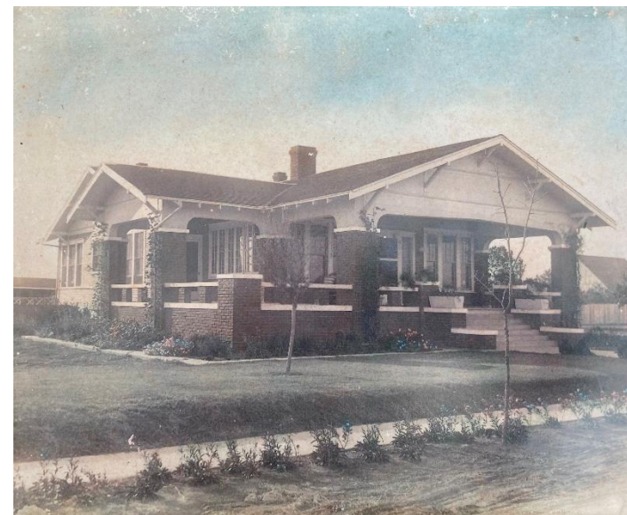
Bottom right: home circa 1915