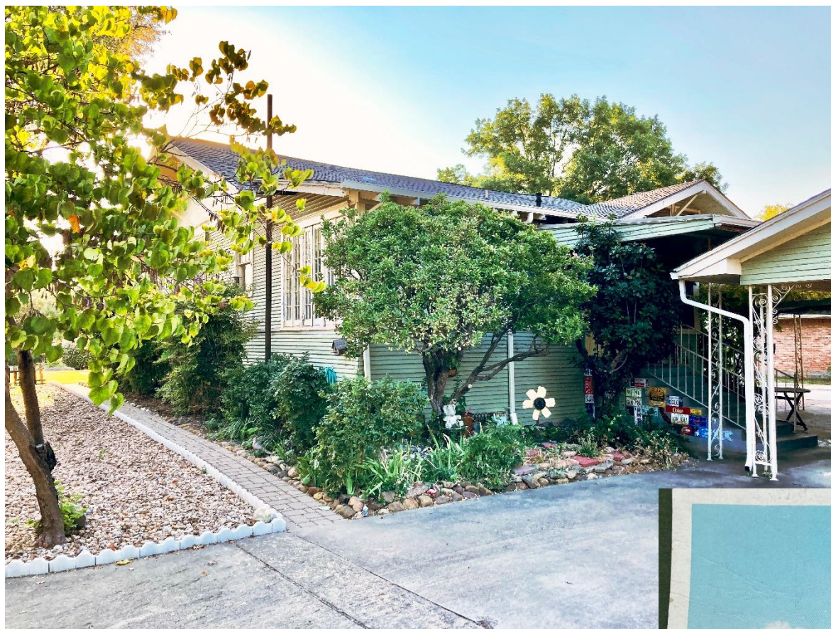
Left: northwest corner Bottom: 1945 postcard of Coffey's Drug Store