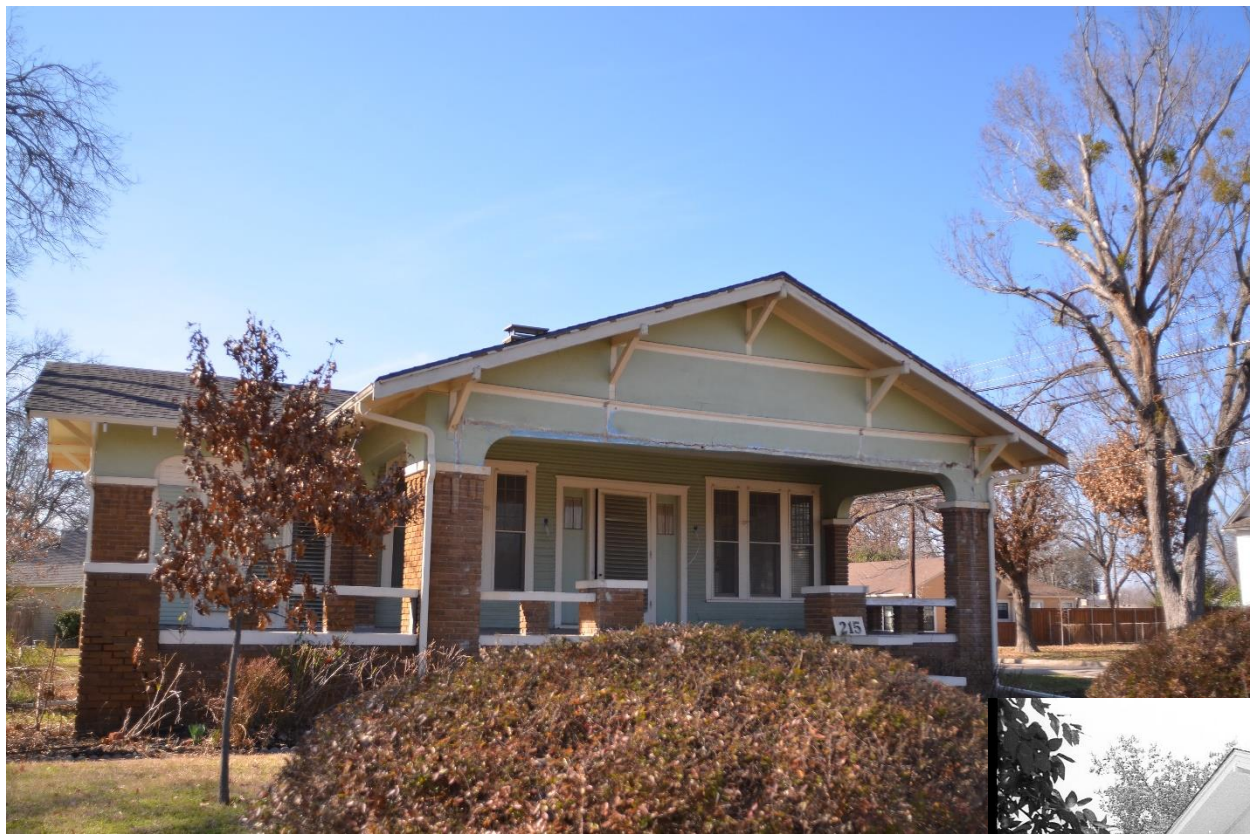
Left: 2015 Bottom: 1985