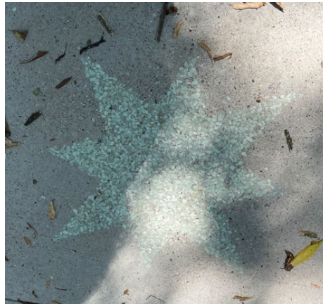
TOWNE LAKE PARK – LIGHT WALK