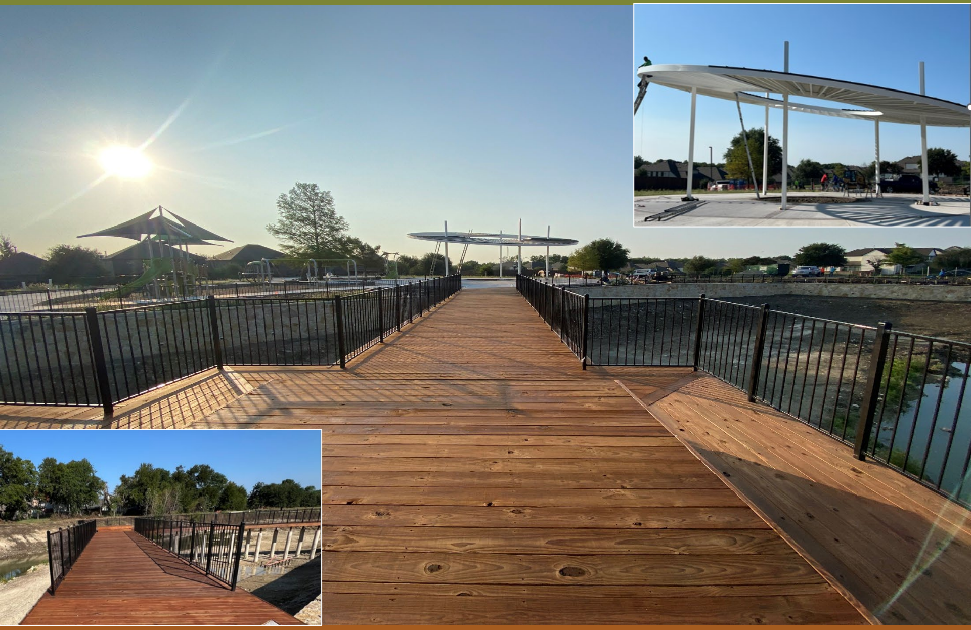
GREENS NEIGHBORHOOD PARK