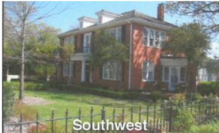
Above: SW View