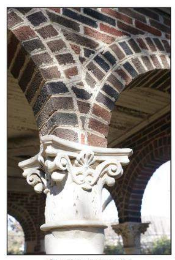
Concrete cast capital