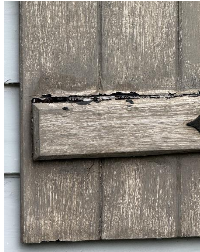
Above: NW View