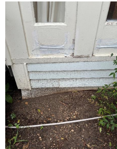
Above: NW View