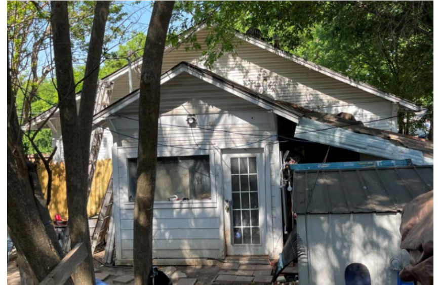
Above: northwest elevation