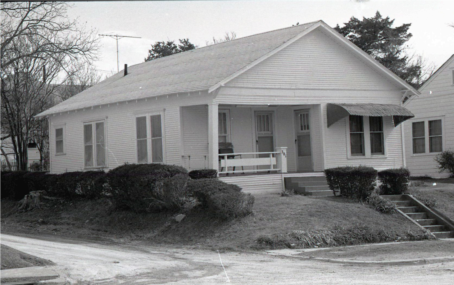
Above: 1985 photo