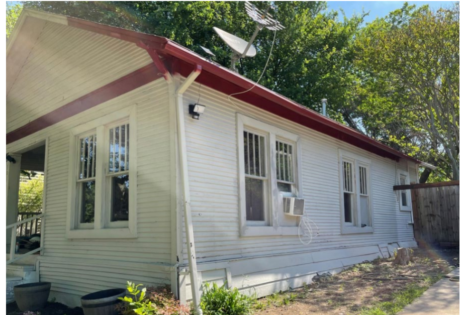
Above: façade (west) Right: southwest elevation