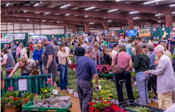
The Garden Show