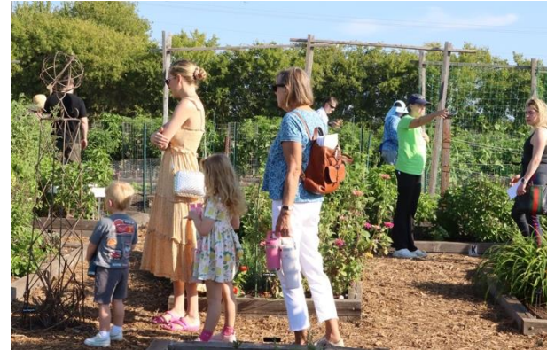
A Walk In The Park