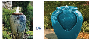
Small Water Features