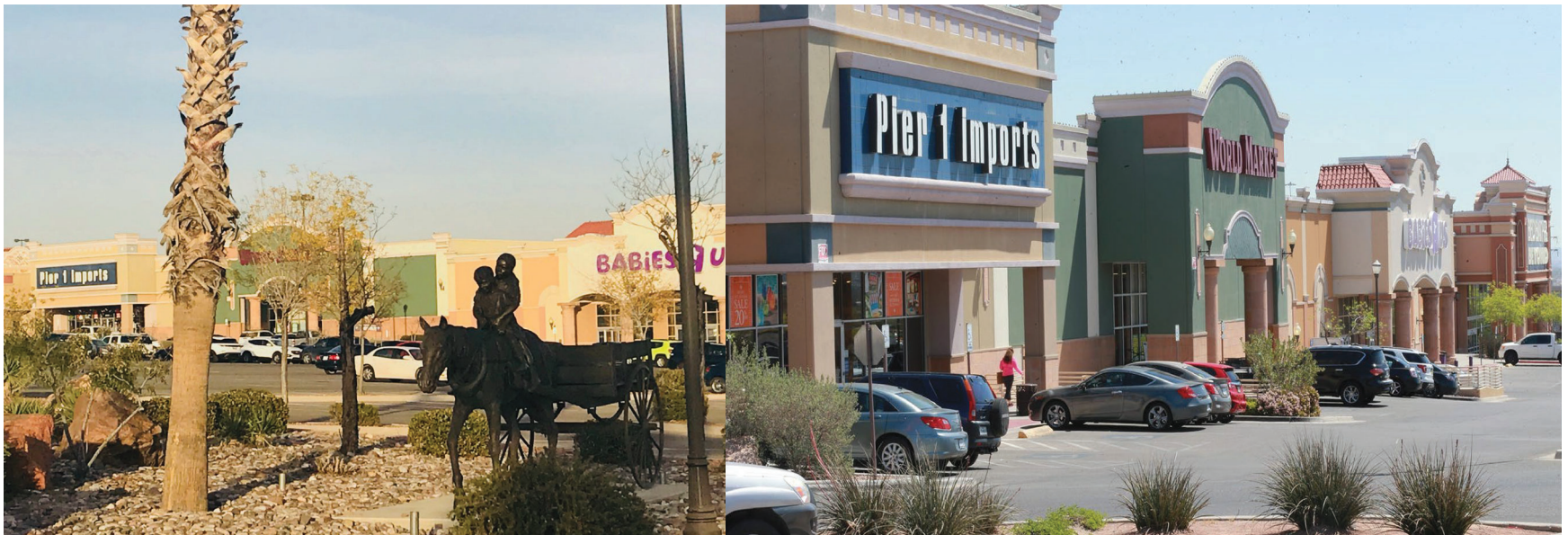
Las Palmas Marketplace

Las Palmas Marketplace is a 900,000 square-foot open-air shopping center developed by De La Vega, that boasts dramatic architectural appeal, pedestrian-friendly walkways and an incredible location near the border, drawing both locals and tourists alike.