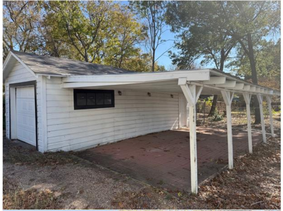
Above: floor is severely bowed upward