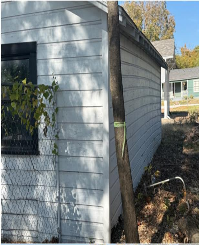
Above: bowed walls