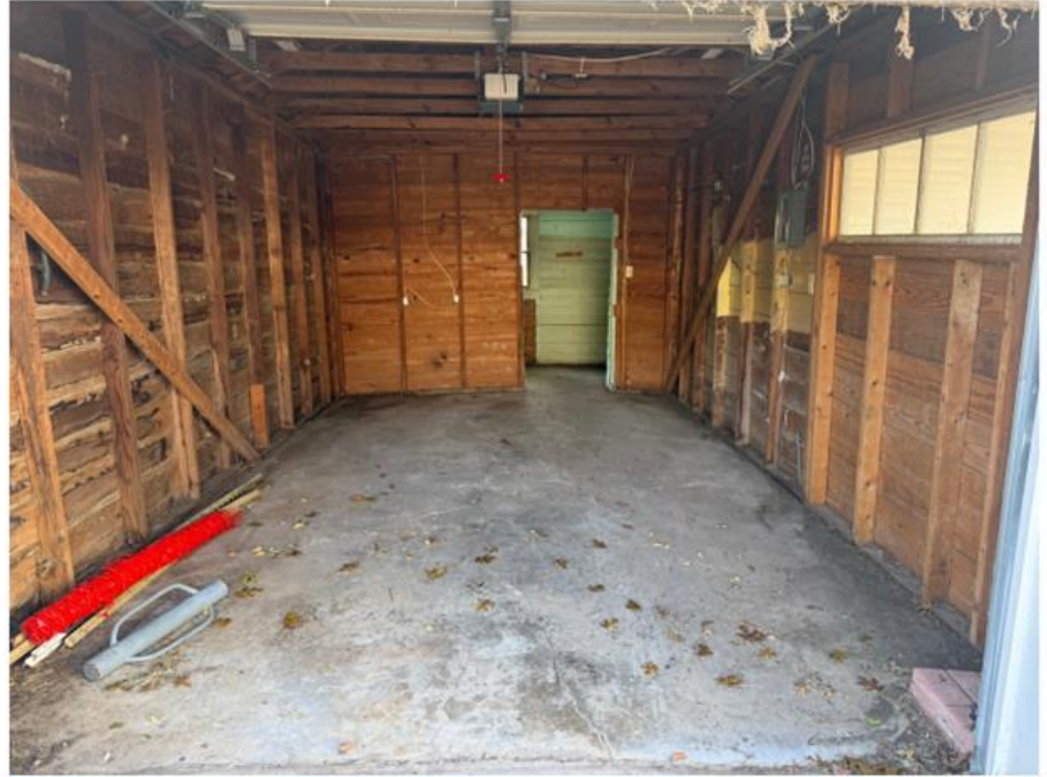
Above: Foundation is severely bowed upward