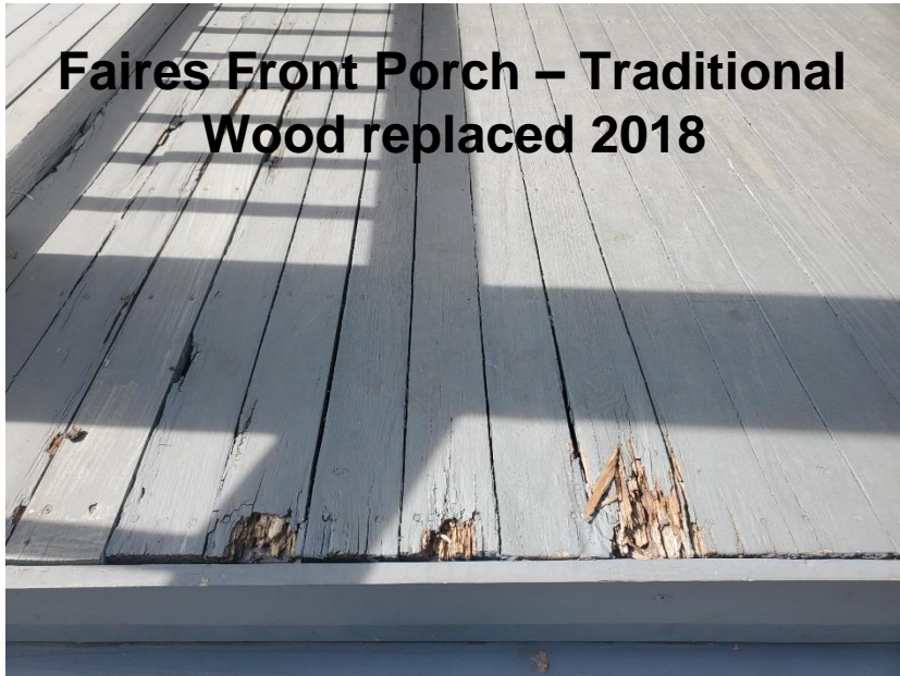
Faires Front Porch – Traditional Wood replaced 2018