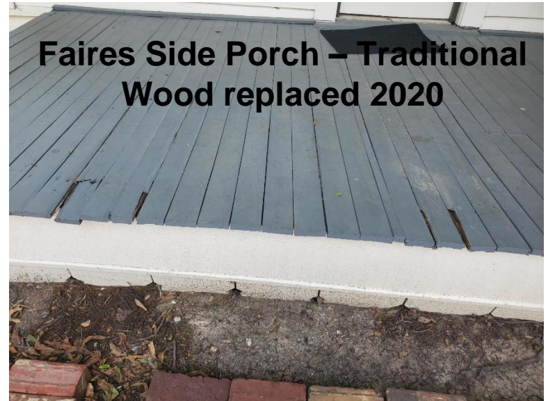
Faires Side Porch – Traditional Wood replaced 2020