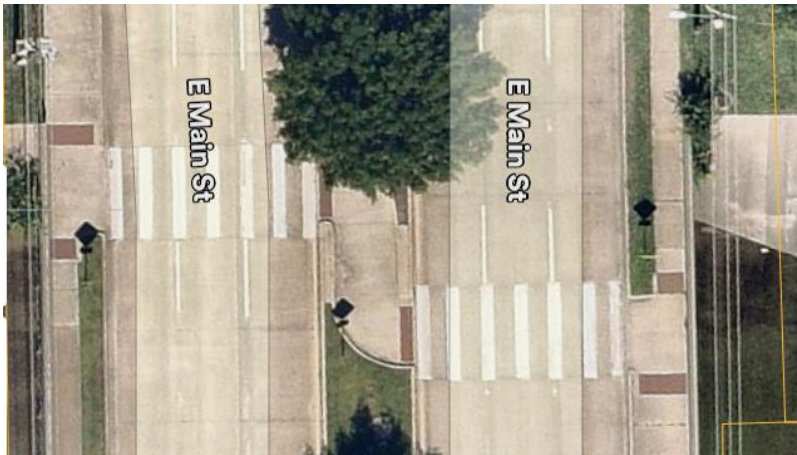
Example Two-Stage Offset Crossing