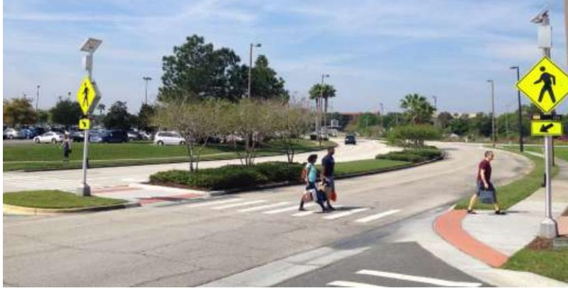
Example RRFB with Refuge Island