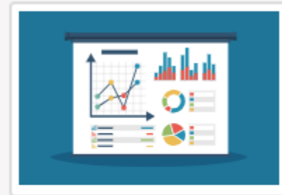
DEVELOPMENT SNAPSHOT PORTAL