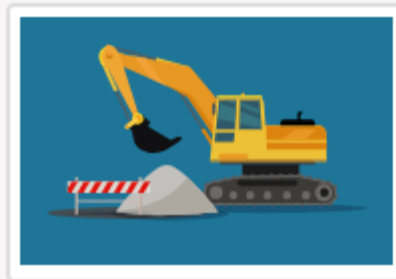
CAPITAL IMPROVEMENT PROGRAM