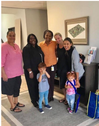
Public Service Programs Helping Children, Individuals and Families