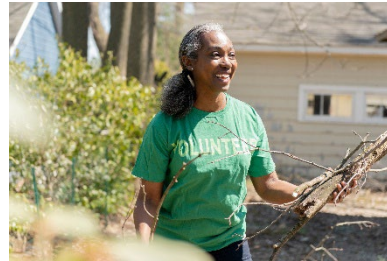
Neighborhood Topper Program Safety, Preservation