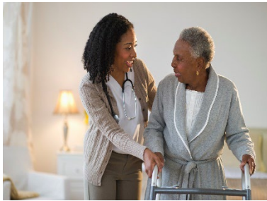
Senior Support Meals on Wheels, Healthcare