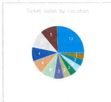
Sales by Location