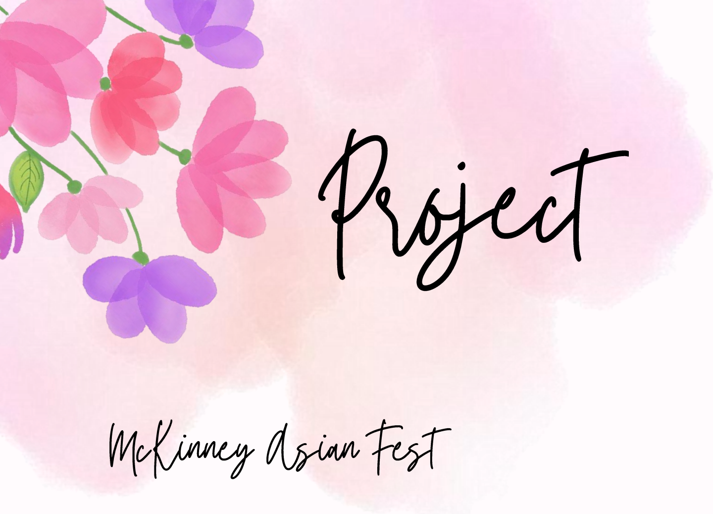
McKinney Asian Fest