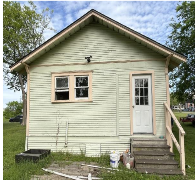
Above: Back of house