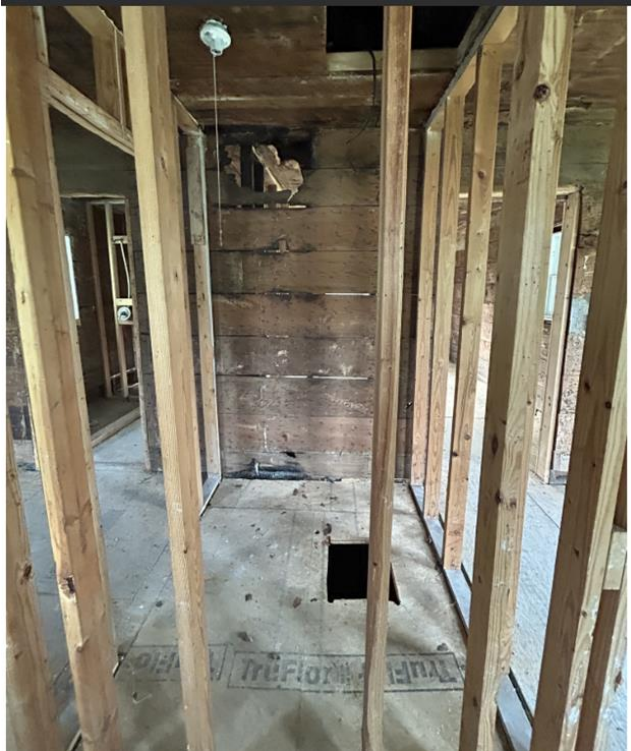
Fire, rot and termite damage