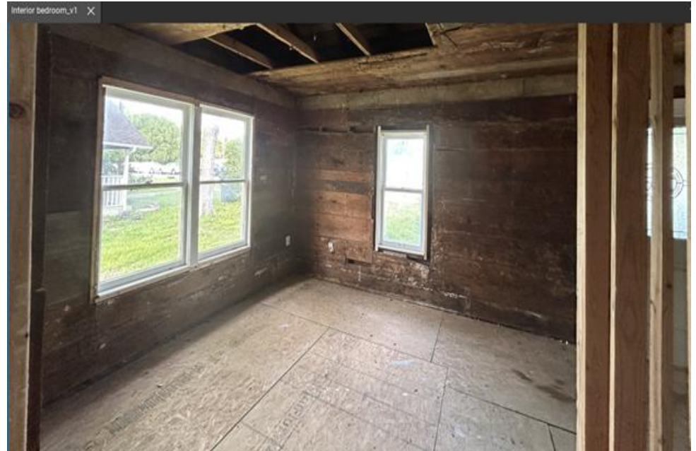
Above: Termite and rot damage