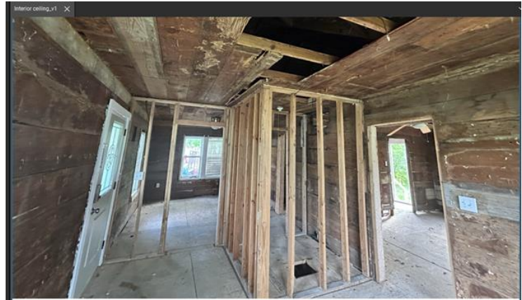
Above: Termite Damage Below: Termite Damage