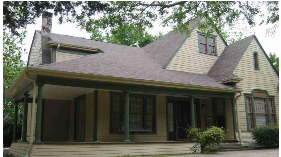
Above: 1985 Below : 2005