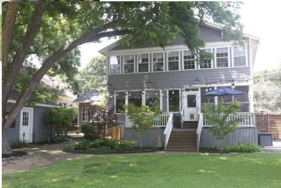
614 N. Church Street J.S. Bristol House