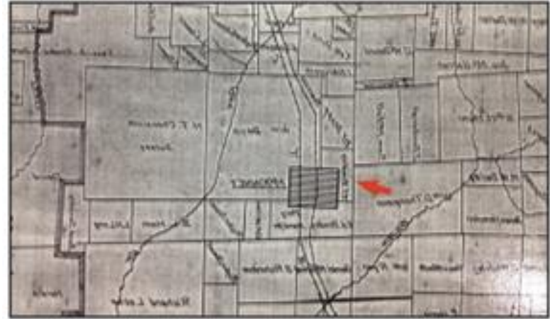
Above: Bradley Survey of 1855 Below: Charles Lee Self House 2015