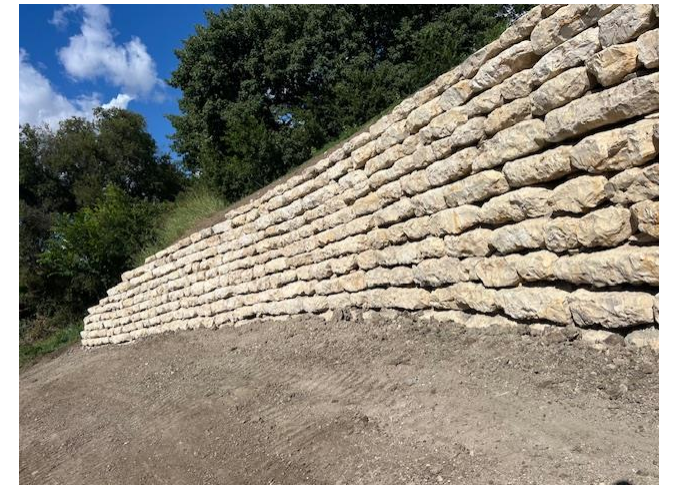
Example of look of final product (from Invited's Clubs of Stonebridge Ranch)