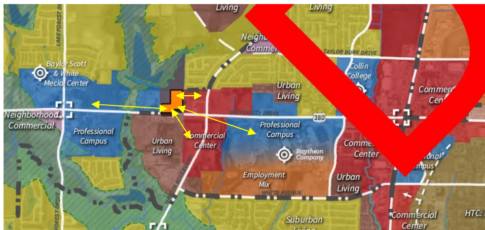
The project site connects easily to existing and proposed employment centers, shopping & entertainment.

“Urban Living areas support a mix housing options in a walkable development pattern. Urban neighborhoods are relatively compact and easy to get around by car, bike or walking. They may contain one or more of the following housing types: small lot, single-family detached, townhomes, duplexes, condominiums, or apartments. The design and scale of the development in an urban neighborhood encourages active living, with a complete and comprehensive network of walkable streets. Although minimal, urban residential neighborhoods provide a small amount of local retail and services that serves the smaller and low intensity neighborhood.”