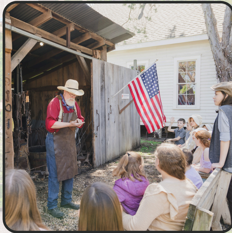
Village Museum, Tours, Exhibits and Youth Camps at Chestnut Square