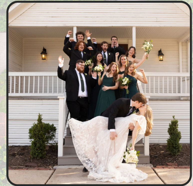
Celebrations at Chestnut Square