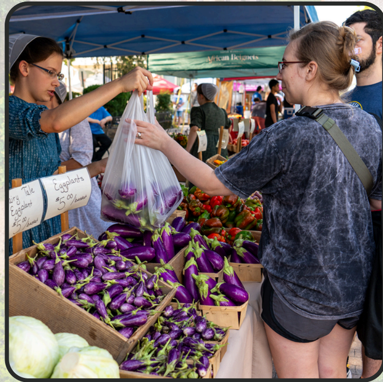
#1 McKinney's Farmers Market at Chestnut Square