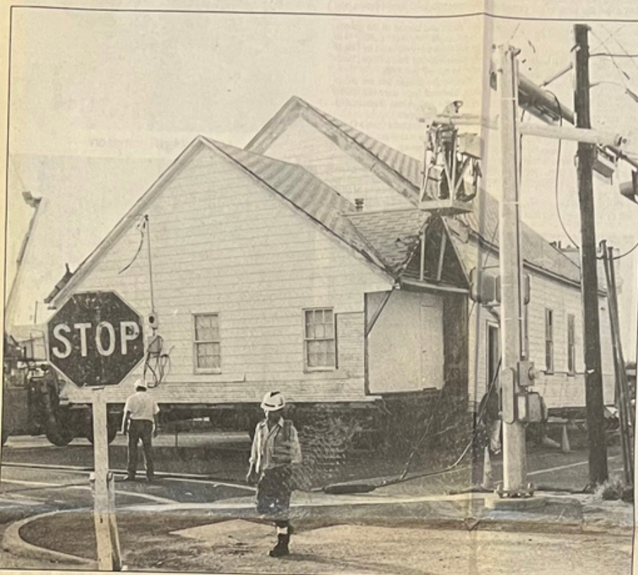
It took 14 hours to relocate the Foote Baptist Church. Now the church is one of the highlights of Chestnut Square.