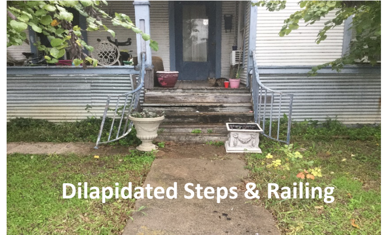
Dilapidated Steps & Railing