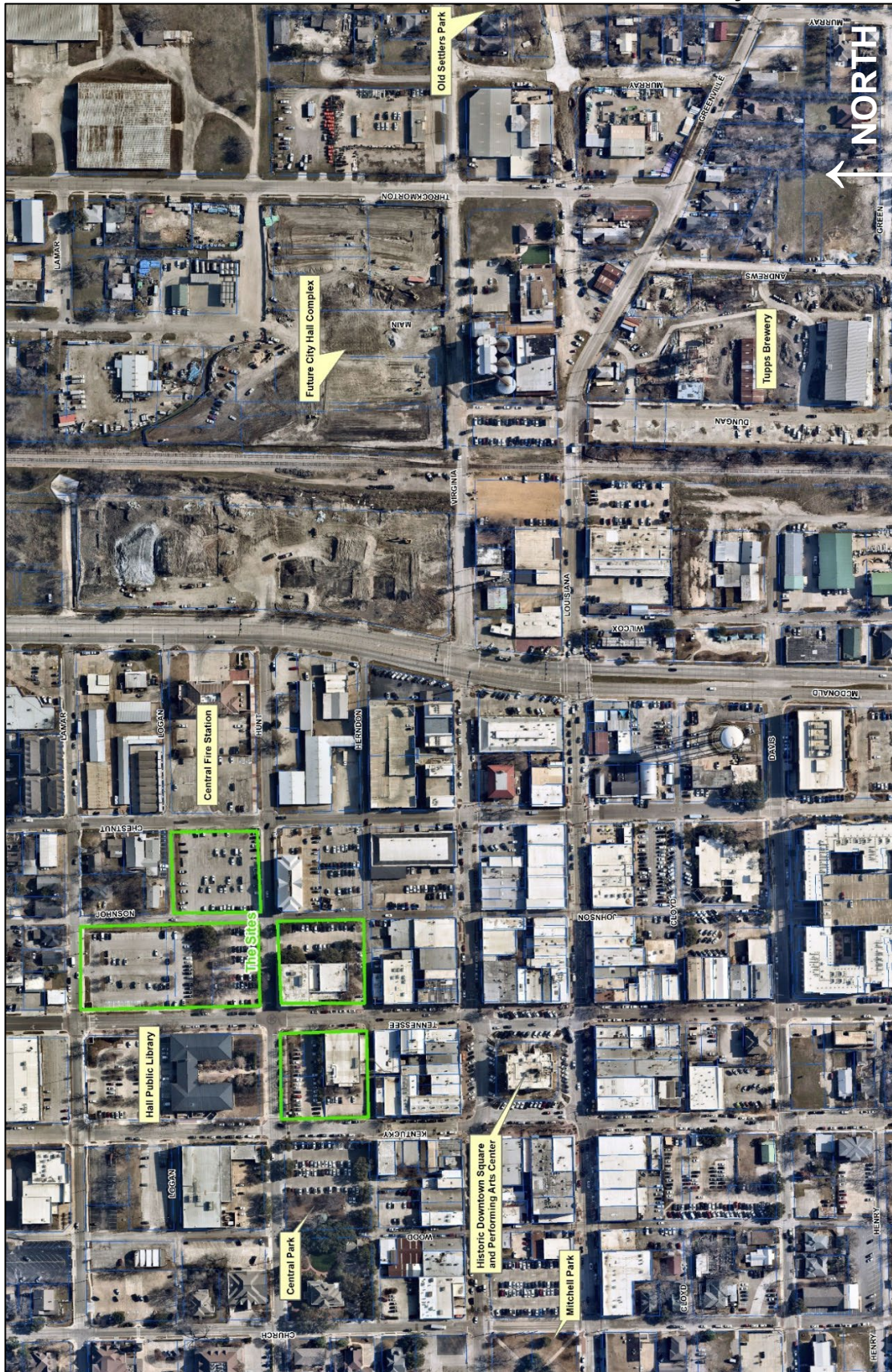
EXHIBIT A. The Four Sites and the Immediate Vicinity