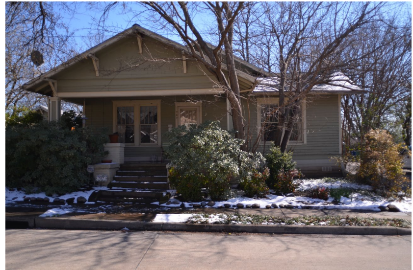
Above: 1985 Below : 2015