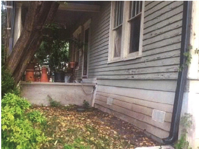
Above: Example of area needing paint and repairs, 2022