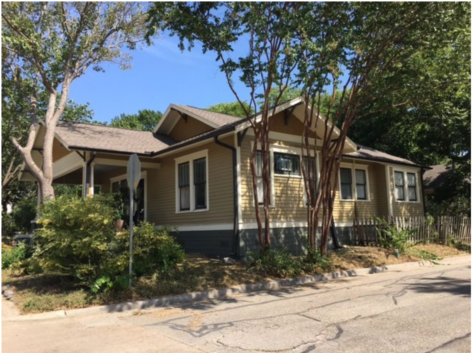
Above: West elevation