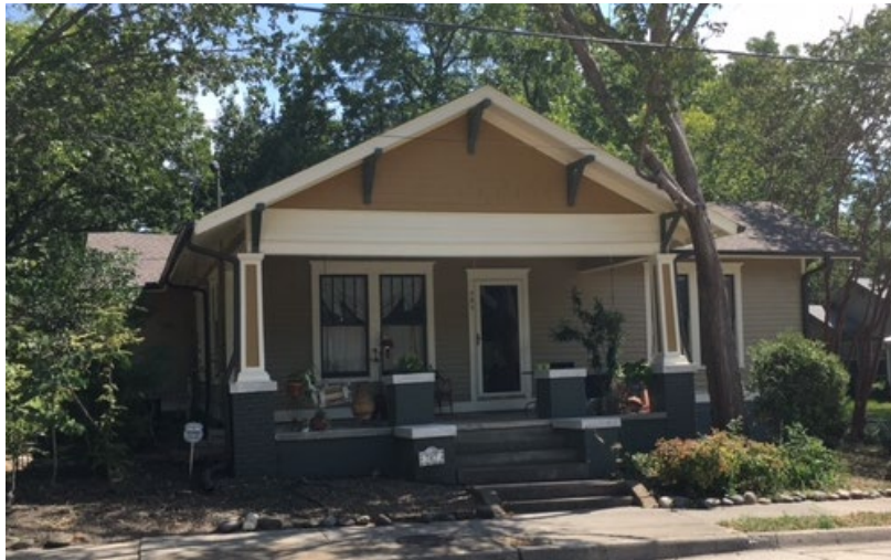
Above: North elevation