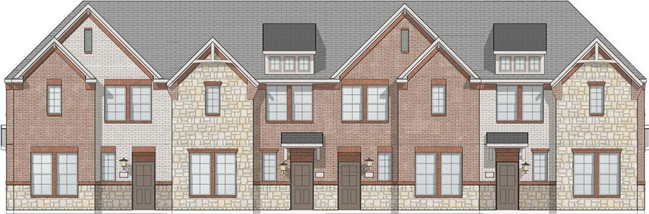
4 HOME BUILDING