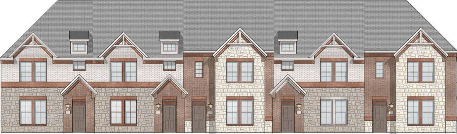
5 HOME BUILDING