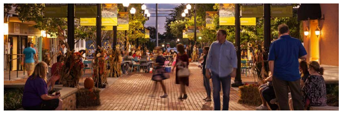
Watters Creek – Allen, TX