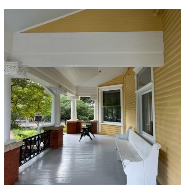
Main Museum Painted Fall, 2021