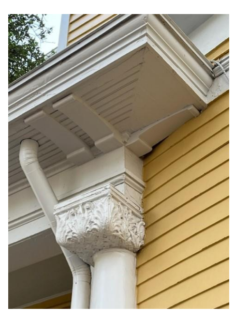
Main Museum Painting Fall 2021