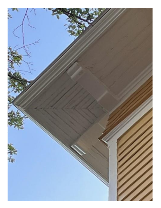
Soffits AFTER Fall, 2021