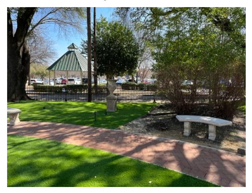
The New View looking East from Garden

The Previous View looking East from Garden