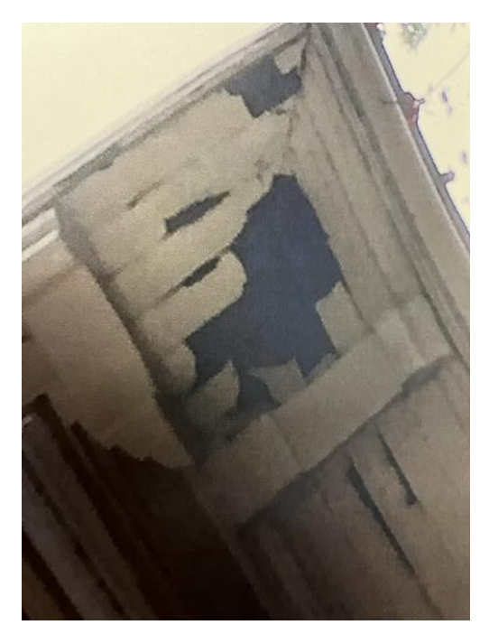
Soffits BEFORE Fall, 2021