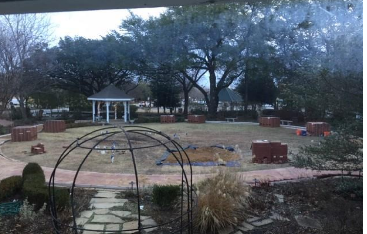
Before the brickwork & lighting