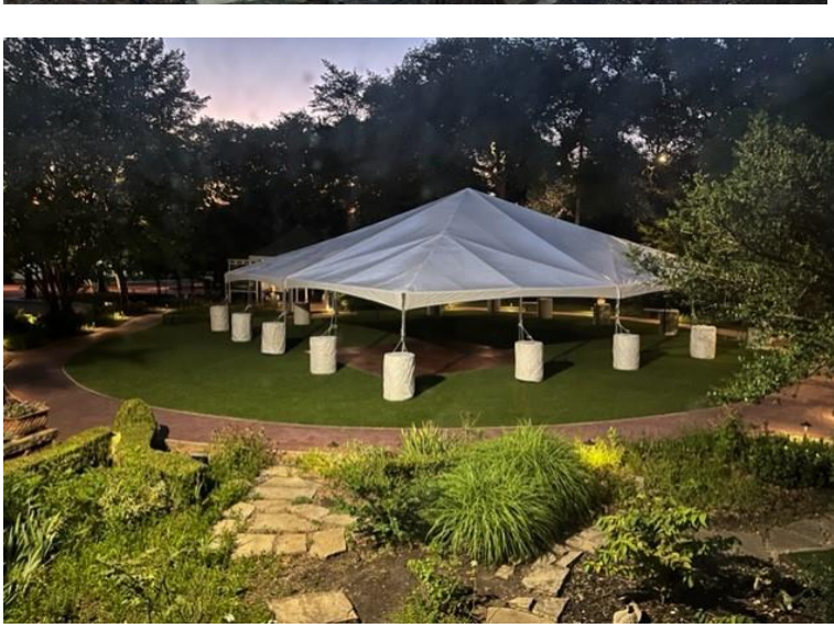
Completed – Wedding at Night