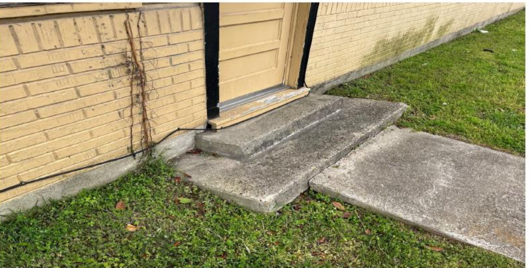
Foundation #1 – 101 S. Chestnut