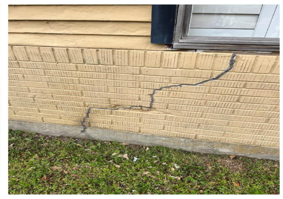
Foundation #2 - 101 S. Chestnut