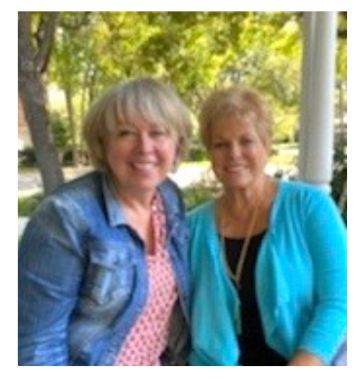
Garden Club Presidents

Garden Club expansion plans Landscape jobs Audio Company jobs Brickwork jobs Added luncheon space