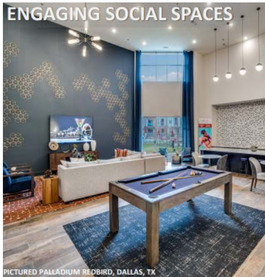
PICTURED PALLADIUM REDBIRD, DALLAS, TX