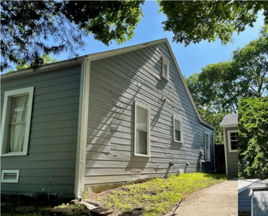
Above: south elevation Right: rear, east elevation