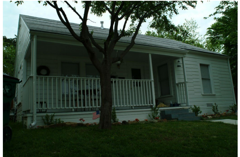
Above: northwest elevation Right: façade in 2005