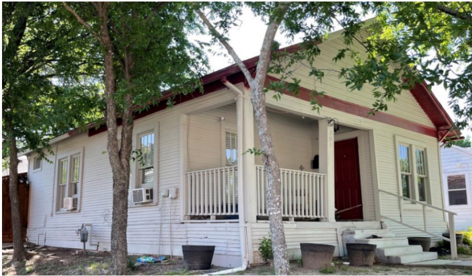
Above: northwest elevation