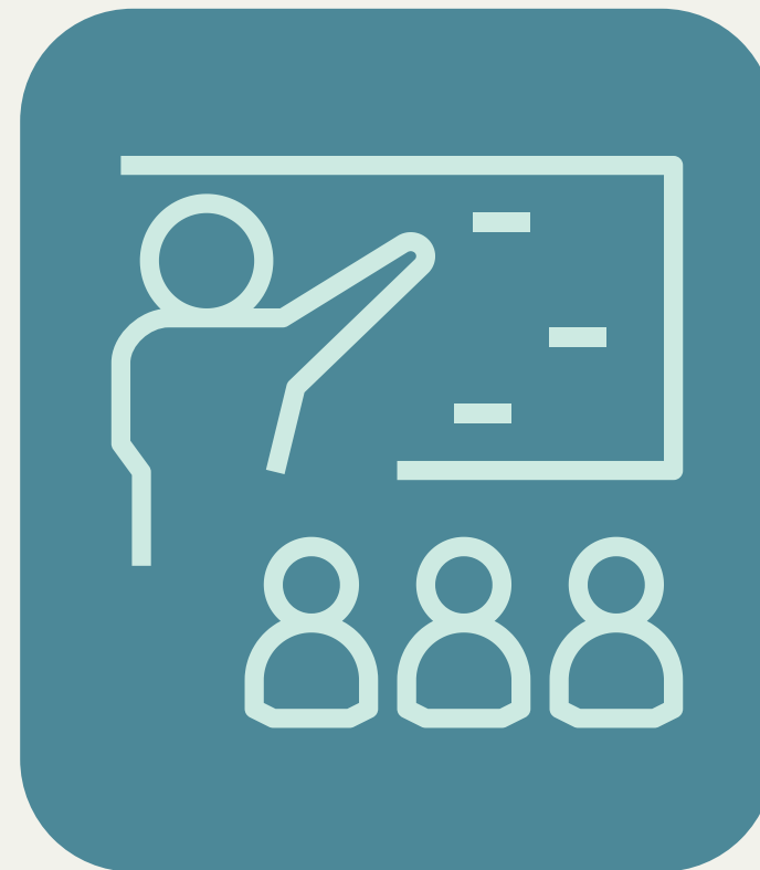
Industry-Focused Trade Shows