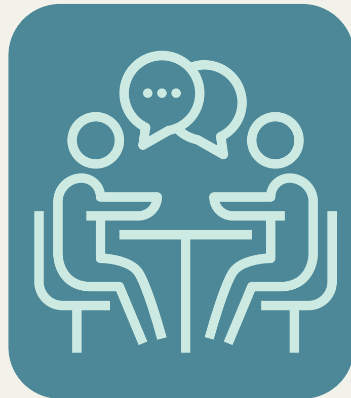
Reverse Trade Shows

that Align with Visit McKinney's Sales Goals