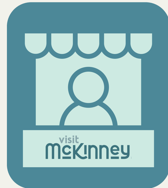
Consumer Trade Shows